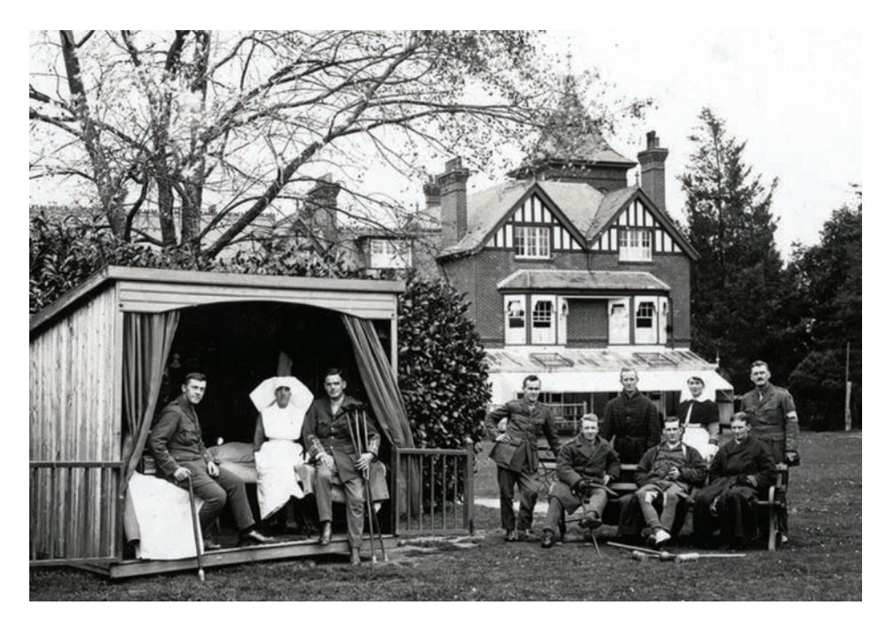
During a break in a therapeutical game of croquet; nurses and patients at The Forest Park Hotel hospital for officers pose next to a vacant isolation ward in the grounds.

Several hospital sites were selected in England for the New Zealanders. By June 1916, the combined sites in Brockenhurst had been re-designated and re-equipped as the New Zealand General Hospital No. 1, operated by the Royal New Zealand Army Medical Corps. The Forest Park Hotel provided 200 beds and was designated exclusively for officers. Also received were Royal Air Force casualties from flying accidents at the nearby Beaulieu aerodrome.