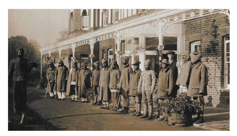
Staff and patients at The Forest Park Hotel military hospital in November 1914.

In November 1914, soon after the first cohort of wounded Indian soldiers arrived at Brockenhurst, they were visited by King George V, Emperor of India, and Queen Mary, the Empress.