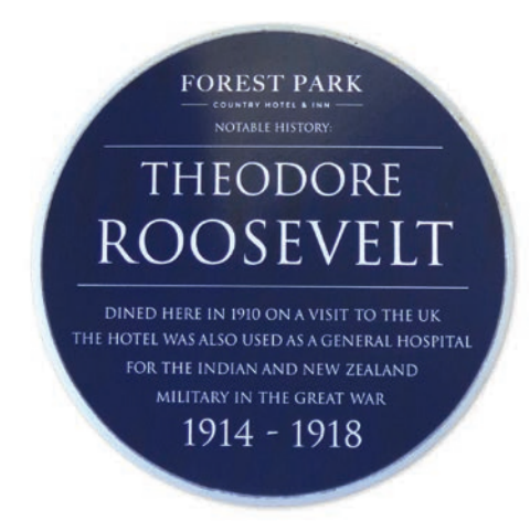
A commemorative plaque near the entrance to The Forest Park Hotel.