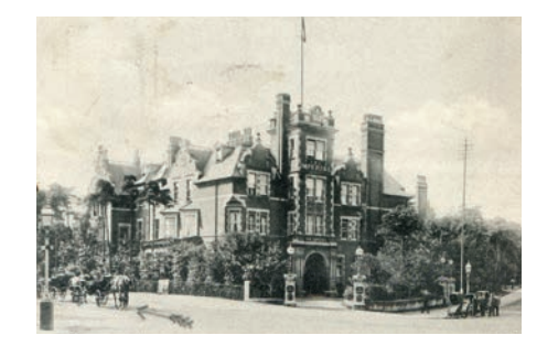
The Imperial Hotel, East Cliff, Bournemouth.