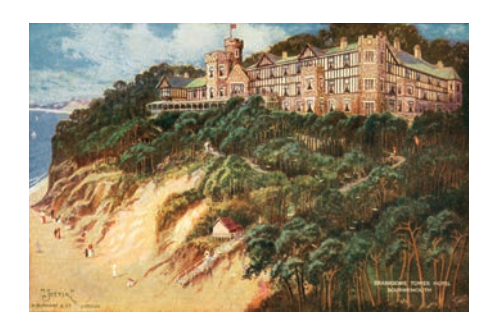
The Branksome Tower Hotel.