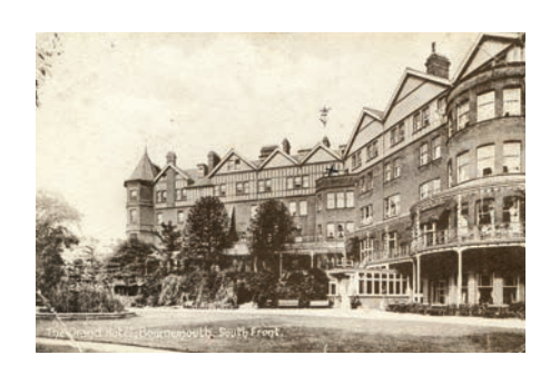
The Grand Hotel, East Cliff, Bournemouth.