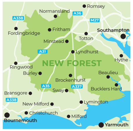
The traditional extent of the New Forest medieval royal hunting ground.

Since medieval times, the New Forest has comprised three distinctly different countryside environments: of woodland; of open land of grass, heath, or mire; and of enclosed farmland. Each environment now totals about a third of the whole area. The enclosed farmland was developed and granted to medieval landholders on condition that the king retained the exclusive right to hunt the 'wild beasts' throughout the whole of the forest.