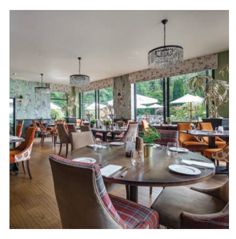
The refurbished restaurant.

In 2015, Forestdale Hotels went into liquidation. It was broken up and a year later The Forest Park Hotel was sold to a Brockenhurst builder, under whose control it continued to trade but at a much-reduced level. About half of the grounds, including the stable buildings, was carved off and used to build luxury houses. The tennis court became a hotel car park, and the swimming pool was filled in.