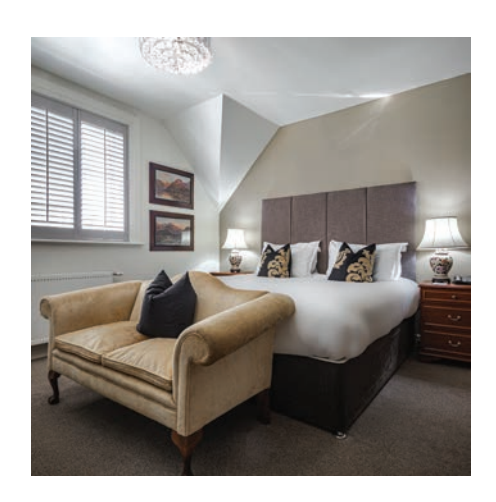
One of the new, individually-styled rooms.

In 2019, they refurbished the hotel at a cost of about £1.5 million. It was restored to its former glory and very quickly became a highly successful and award-winning business, enabling the partners to sell the hotel in July 2022 to the nation-wide Coaching Inn Group, which could fund further development. Improvements made soon afterwards by the Coaching Inn Group have been in line with the company's commitment to preserving the character of its heritage hotels while also responding to the changing needs of today's customers.