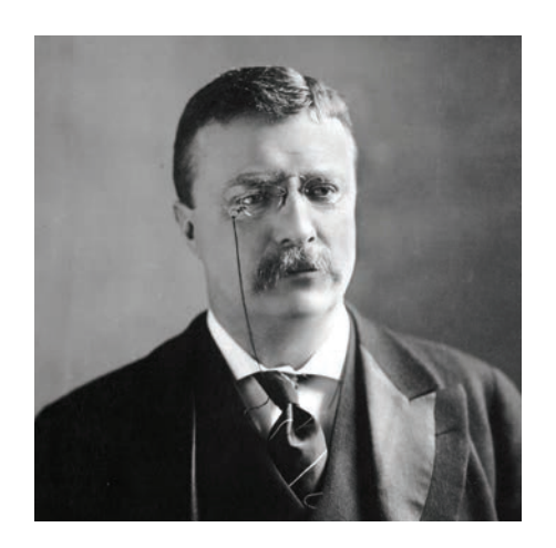
Former USA president Theodore Roosevelt.

After about four hours, the two men arrived at The Forest Park Hotel, wet through and muddy. Roosevelt said afterwards: [We] 'tramped through the New Forest, reaching the inn on the other side of it at about nine in the evening, tired and happy and ready for a warm bath, a hot supper, and bed.' In another report, he said the inn was 'as comfortable as possible.'