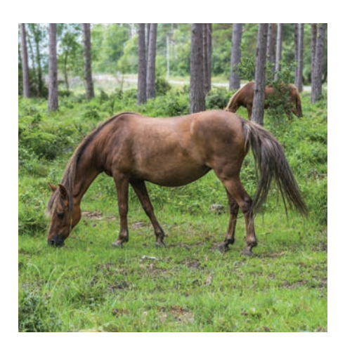
New Forest ponies graze on forest land adjacent to the hotel.

Within it was Ober Farm. For most of the 1800s it provided a living for successive tenant farmers, until 1887 when just over half of its land, about 122 acres, was sold by the then-owner, divided into lots for development to allow for an expansion of Brockenhurst village. One of the lots was a large road-side field of 8½ acres, where now stands The Forest Park Hotel. The field was called Lower Aimers.