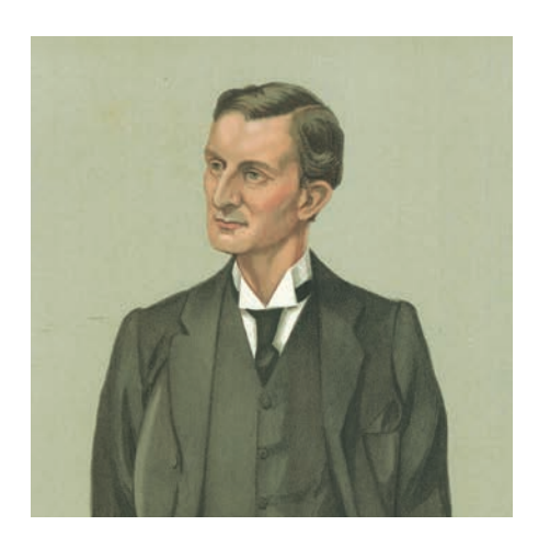
Foreign Secretary Sir Edward Grey in 1903, by 'Spy', Leslie Matthew Ward, for Vanity Fair magazine.