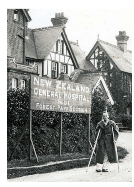
A patient at the entrance to The Forest Park Hotel hospital for New Zealand officers.