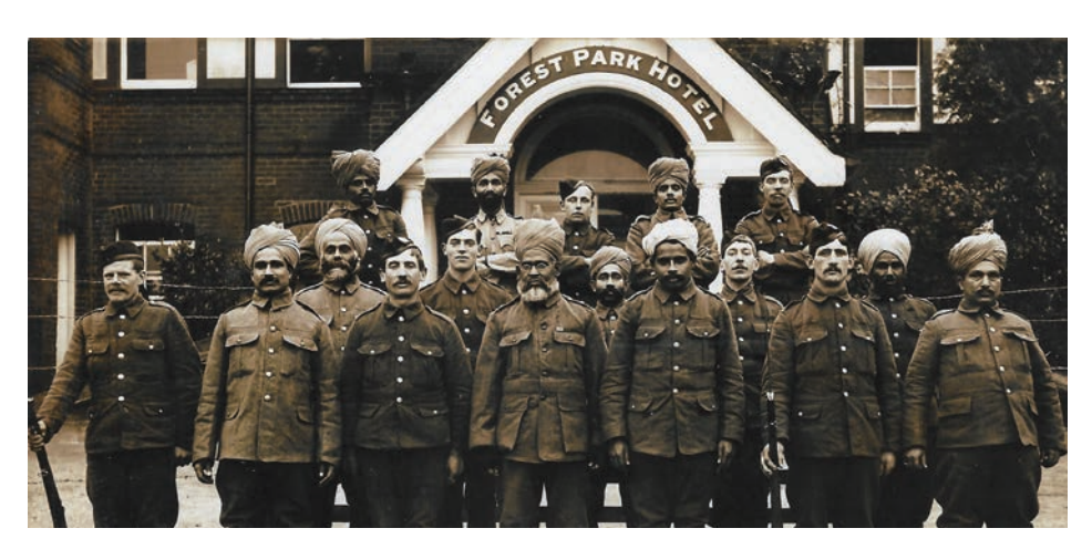
Staff and guards of the military hospital at The Forest Park Hotel in 1914. The guards, who were members of the 3rd battalion, the Highland Light Infantry, were tasked to prevent desertions.

The bodies of Hindus and Sikhs were cremated at a site near the Tile Barn Hill complex, and Muslims were taken to a newly dedicated Islamic burial ground, 70 miles away in Woking, Surrey, close to the UK's first purpose-built mosque. Three Indians, who were members of the medical staff, were buried in the churchyard of Brockenhurst's St Nicholas Parish Church.